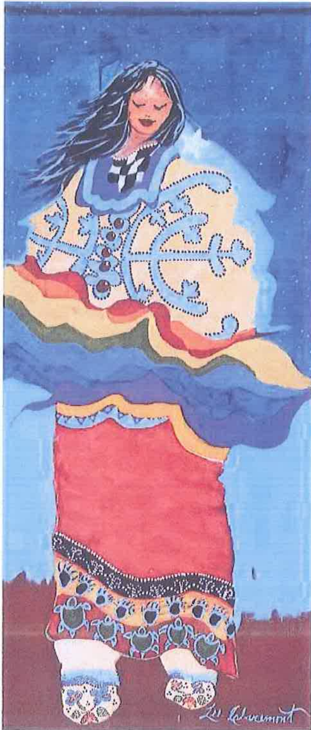
Example of Existing Banner on Leon