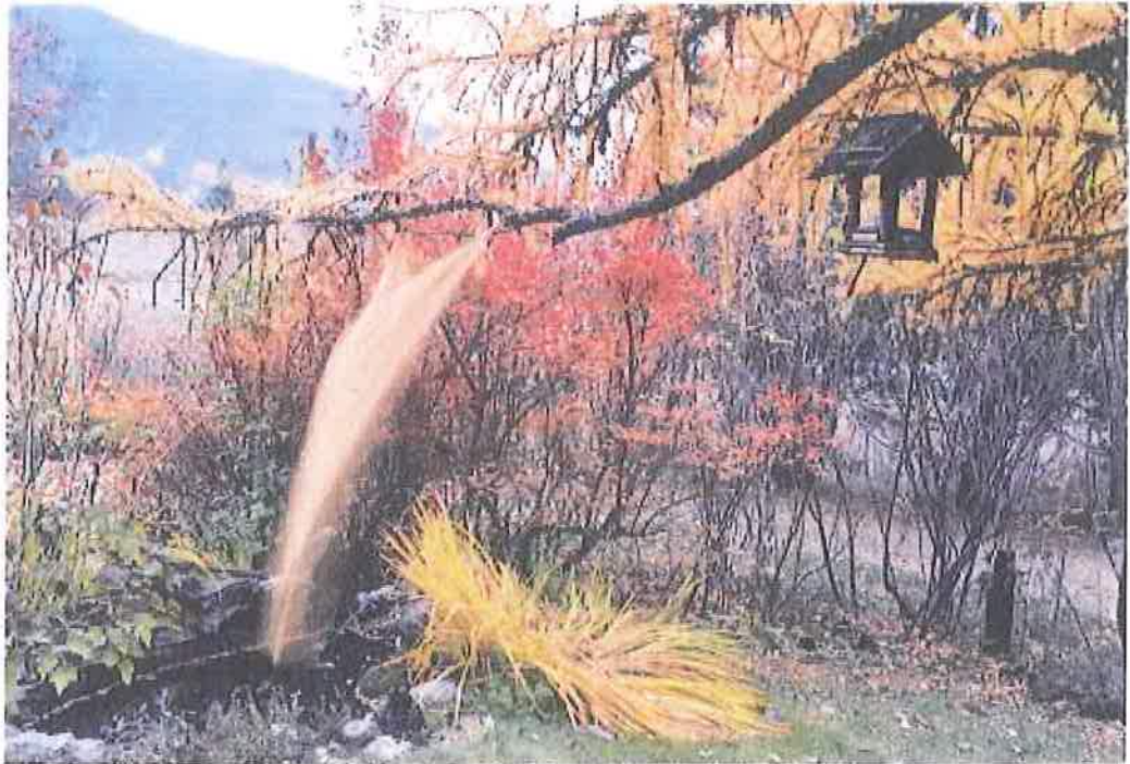
Syntony: Synchronicity and Resonance , 2007, larch dyed silk, 45 cm x 110 cm.