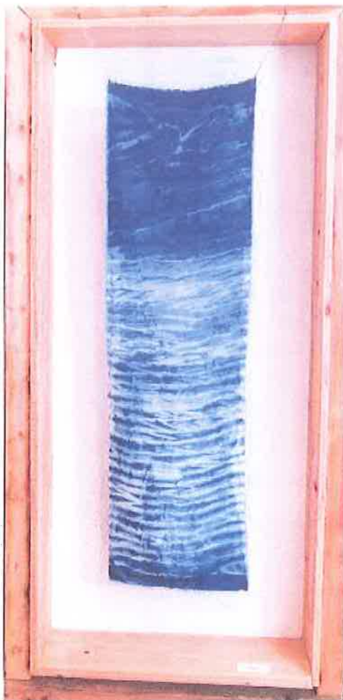
Saiting 2006 , Aug. 15, 2007